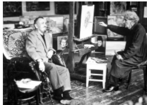
Nobel Laureate John Steinbeck posing for Martiros Saryan, November 15, 1963

On the first floor are his graphic works, book illustrations, stage designs, etc. There is a total of about 200 art works on exhibit, 80 of which were donated by the artist.